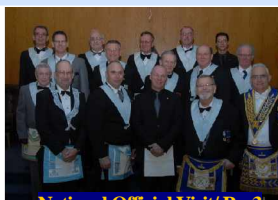
National Official Visit/ Pg. 3