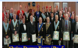
Shrine Degree Team /Pg. 5