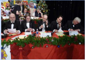
FREEMASONRY IN THE COMMUNITY pg. /4