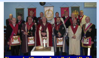
Espanola Chapter Installation/ Pg.8