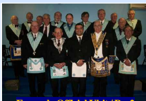
Espanola Official Visit / Pg. 2