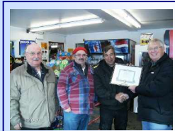
Sudbury Shrine Club News / Pg. 3

Congratulations & Best Wishes / Pgs. 5 & 6